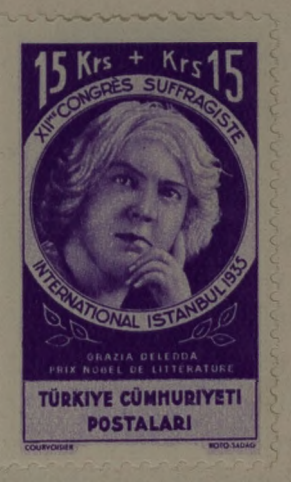
Grazia Deledda (purple)