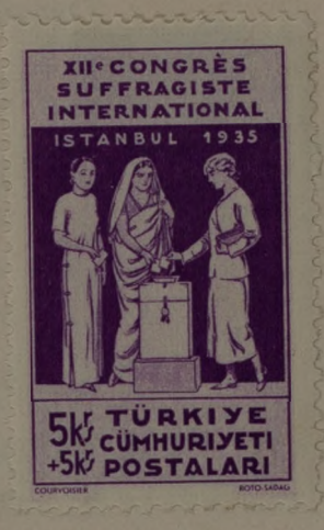
Women voters (purple)