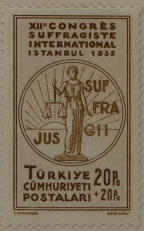
Alliance badge (sepia)