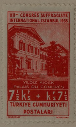
Yildiz Palace, Istanbul (red)