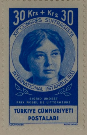
Sigrid Undset (ultra-marine)