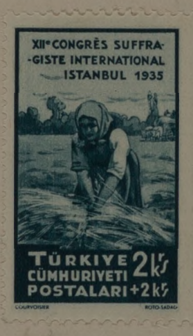
Woman farmer (grev)