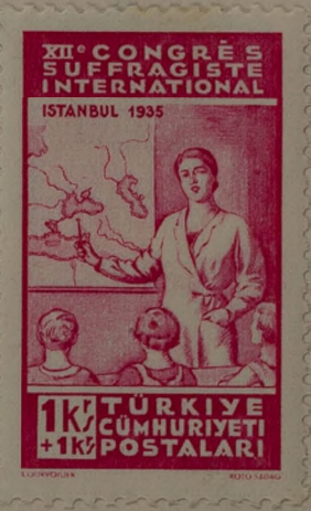
Woman teacher (pink)