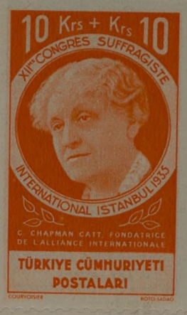
C. Chapman Catt (orange yellow)