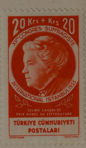
Selma Lägerlöf (Orange red)