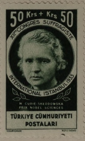
Mme. Curie-Skłodowska (olive green)