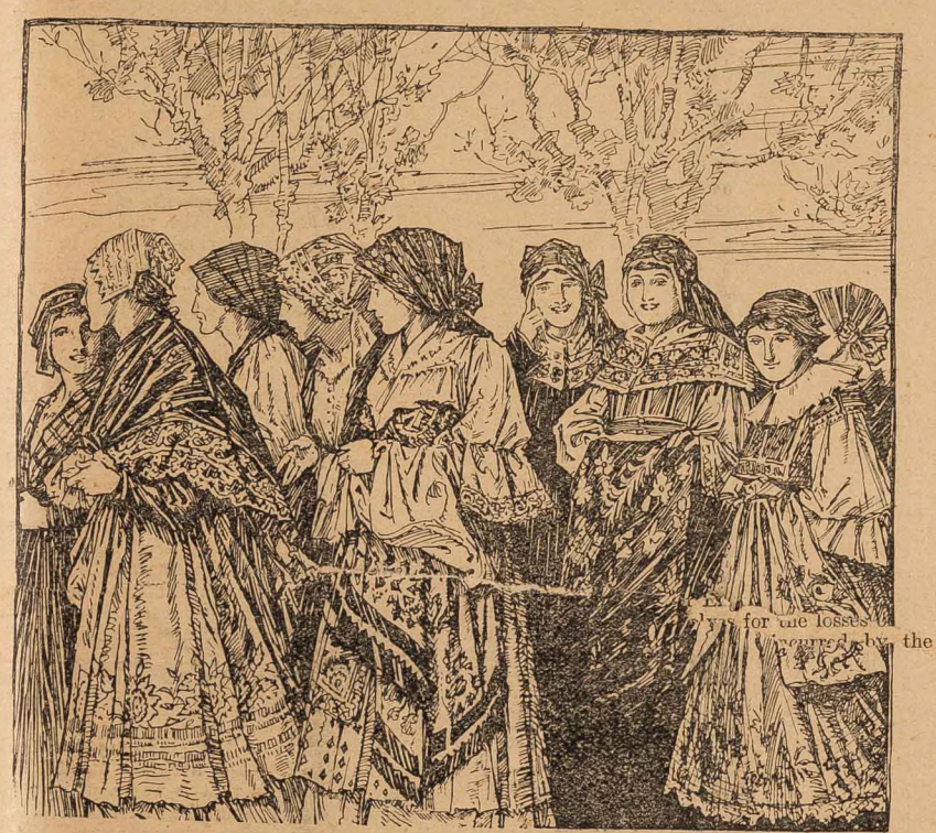
WOMEN OF THE NEW CZECHO-SLOVAK REPUBLIC, where, as in all the neighbouring countries, Bolshevism is rapidly spreading,