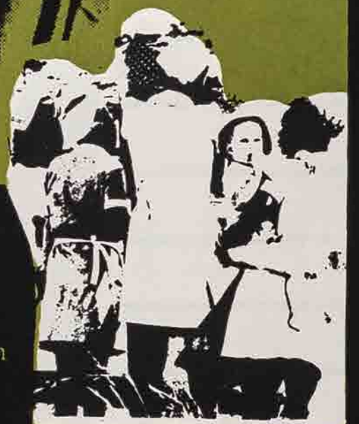
125,000 black domestic servants are prohibited from having their children living with them in the white suburbs.

*average land allocation is 147 acres per white, 7 per black. *average white wage is 54R a month, black wage is 49R a month. *at least 1,650 Africans are in prison without trial. *over 100 people have been illegally executed since 1975. *the Smith regime spends one third of its national budget on fighting the guerillas.