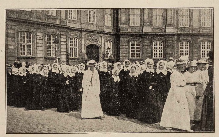
THE DEACONESSES IN THE PROCESSION.