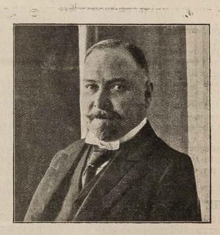
THE PRIME MINISTER, TH. ZAHLE,