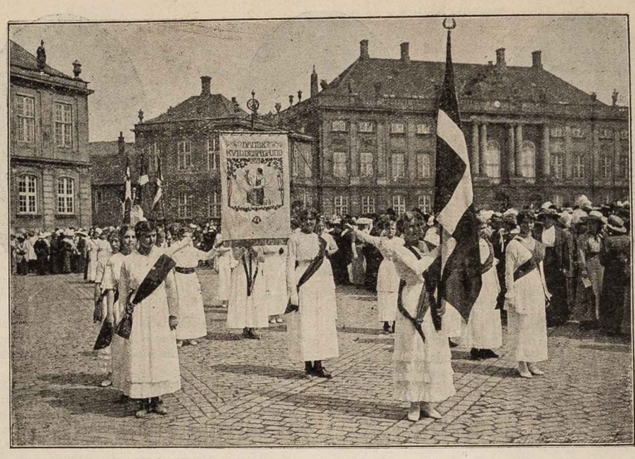
THE WOMEN'S BANNER HEADING THE PROCESSION.

Proposals for changes in the Constitution must be submitted to a plebiscite. From Le Danemark.