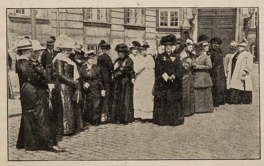
THE DEPUTATION OUTSIDE THE KING'S PALACE, JUNE 5th, 1915.