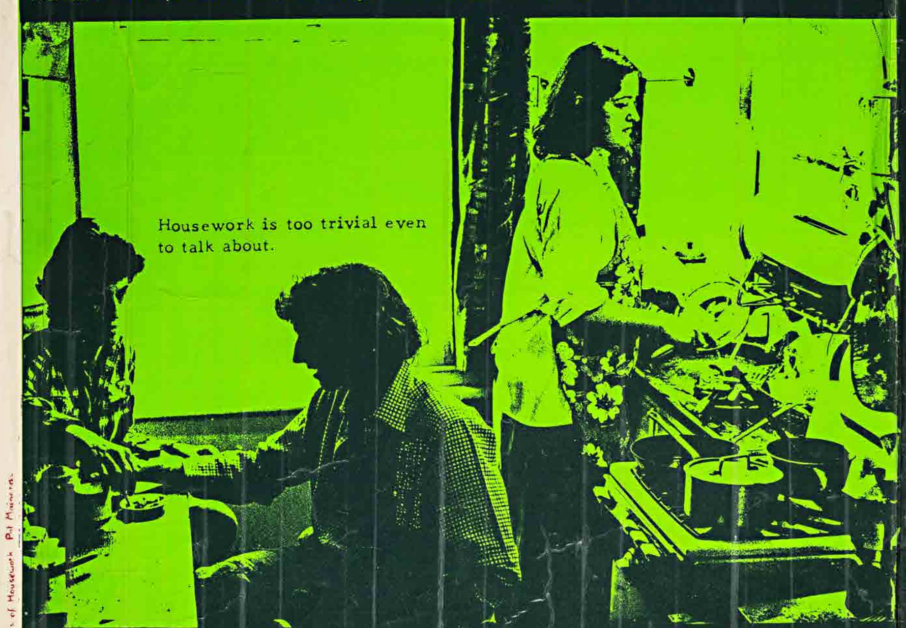
Meaning: its even more trivial to do it Housework is beneath my status. My purpose in life is to deal with matters of significance. You should do the housework.

Also meaning; I can provoke innumerable scenes over the housework issue. Eventually, doing the housework yourself will be less painful to you than trying to get me to do half.