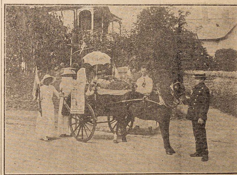
At Torquay Regatta.

THE STORY OF THE CARAVANNERS. Since they left Edinburgh, the Scottish Caravanners have covered many miles of rugged and wild the colliers, "Above ground, below ground, all through the Valley, it is nothing but Suffragettes." Because of this feeling no difficulty loked for. At Ferndale many miles of rugged and wild be principal newsagents to sell the places great meetings have been supplied to the places great meetings have been supplied to the places great meetings have been supplied to the colliers, "Above ground, below ground, below ground, below ground, below ground, below ground, below ground, below ground, below ground, below ground, below ground, below ground, below ground, below ground, below ground, below ground, below ground, below ground, all through the Valley, it is nothing but Suffragette," and exhibit the weekly poster so that a regular and ever-increasing sale can be confidently looked for. At Ferndale many miles of rugged and wild