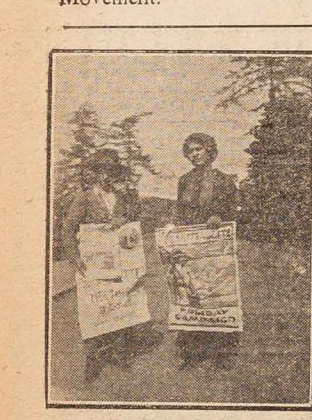
SUFFRAGETTES IN THE LAKE

the great f ght. Into almost every town and village in the three Kngdoms has the truth been ca ried, and the seed sown which in many instances has come to flower even while we write. On these pages week by week have been reproduced photographs which speak for themselves, and in this issue t'e pictures the ever growing and widen-ing interest of the Woman's