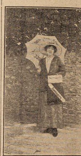
"The Truth for a Penny."