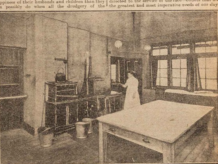
Kitchen at Letchworth Garden City