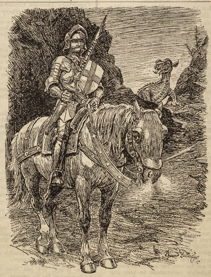
ST. GEORGE'S DUSK.

[Registered with the G.P.O. for transmission] Price 3d.