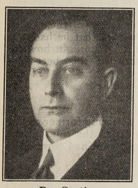
Dr. Curtius German Foreign Minister

wrong way? All those questions must be asked, but it is not necessary to give them a decisive answer here. That will be done in the official discussion at Geneva.