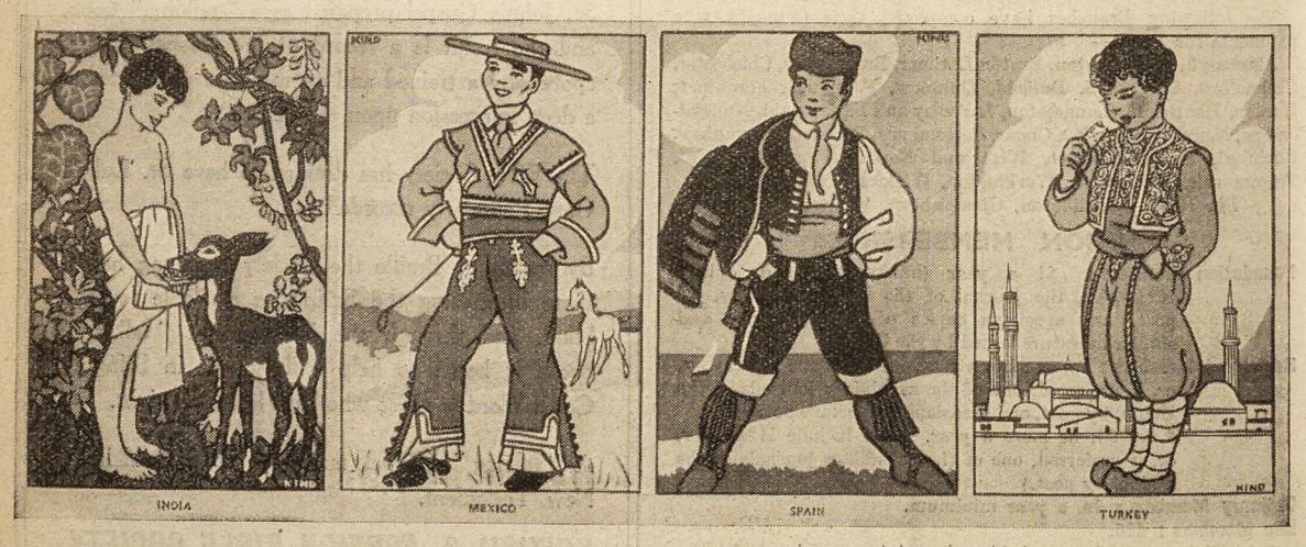
Obtainable from the Union's Book Shop.