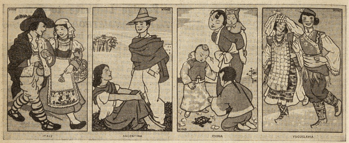
Printed in brilliant colours, with a brief description of the country concerned on the reverse of each card.