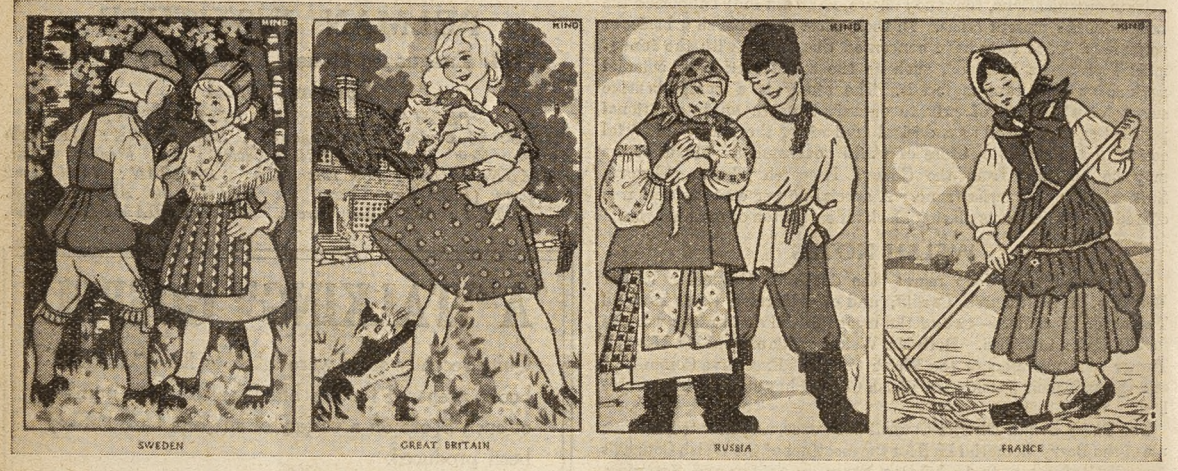
Two sets of 6 cards, price 1/- per set or 1/6 for the complete issue.