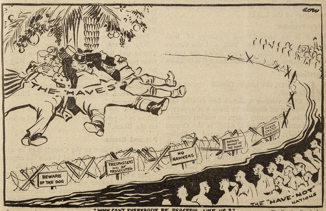
By courtesy of