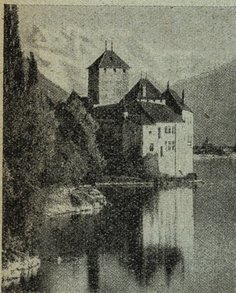
THE CASTLE OF CHILLON

Lake and Mountain excursions will be arranged in consultation with members of the party who are taking the week-end extension. (The cost of excursions is not included in the fee.) Among the delightful excursions that may be taken from Geneva are a