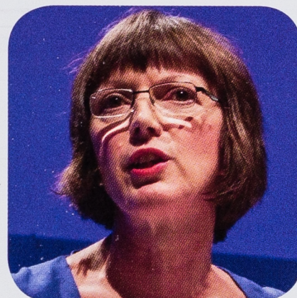
Frances O'Grady, General Secretary, Trades Union Congress (TUC)/Ysgrifennydd Cyffredinol y TUC

Leaving the EU "would be very, very damaging for Great Britain." 19/02/2016