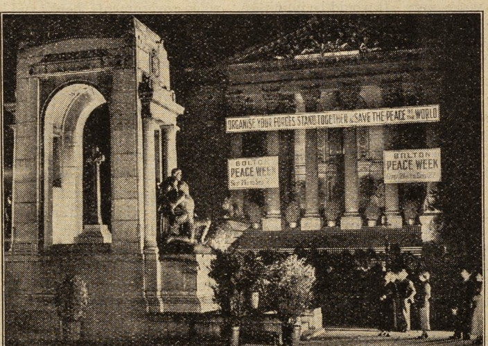
The War Memorial and Town Hall illuminated during the Bolton Peace Week, which was a sequel to the First WORLD PEACE CONGRESS at Brussels. (With acknowledgments to the "Bolton Evening News.")