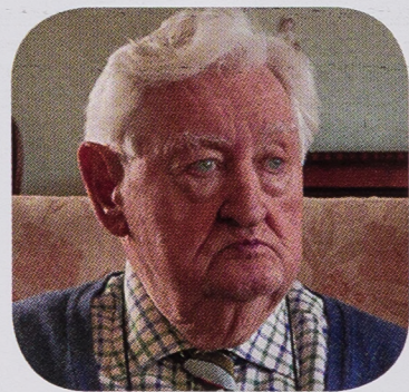
Field Marshal Lord Bramall, former Chief of the Defence Staff/Cadlywydd yr Arglwydd Bramall, cyn-bennaeth y Staff Amddiffyn

"We would be going backwards, not forwards in what we set out to cure after the terrible tragedies of the Second World War." 08/05/2016