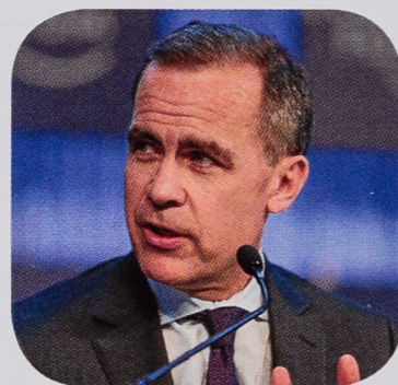
Mark Carney, Bank of England Governor/ Llywodraethwr Banc Lloegr

"UK businesses can create more jobs in Europe than out on their own." 17/01/2016