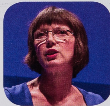
Frances O'Grady, General Secretary, Trades Union Congress (TUC)/ Ysgrifennydd Cyffredinol y TUC

"We would be going backwards, not forwards in what we set out to cure after the terrible tragedies of the Second World War." 08/05/2016