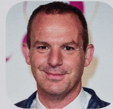
Martin Lewis, Leading Consumer Champion/ Pencampwr Defnyddwyr

"Brexit would have massive implications for jobs, rights, and the very fabric of the UK. If you take that floor away, workers will be worse off." 27/01/2016