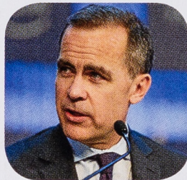
Mark Carney, Bank of England Governor