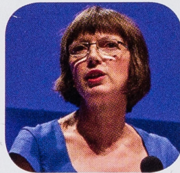
Frances O'Grady, General Secretary, Trades Union Congress (TUC)