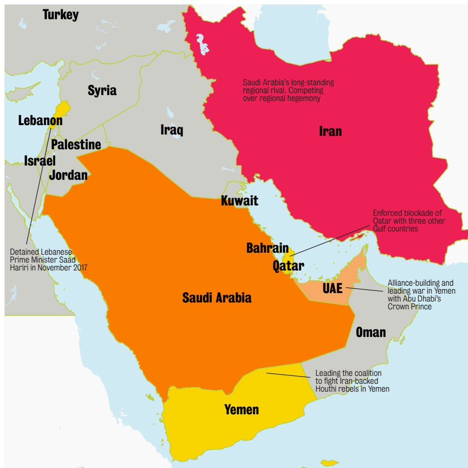
Figure 1: Saudia Arabia's regional flashpoints

Saudi Arabia's ambitions have formed the basis for a more muscular foreign policy, evidenced by a number of diplomatic spats and incidents, as well as the fighting of proxy wars in Yemen and Syria. 6 Incidents have included a blockade of Qatar by Saudi Arabia, the UAE, Bahrain and Egypt, which ultimately backfired 7 ; an odd two-week period in November 2017 when Saudi Arabia was holding the Lebanese Prime Minister, Saad Hariri, hostage in Riyadh and tried to force him to resign – which equally failed thanks to a deal for his release brokered by the US, France and Egypt; and alliance-building with the UAE for the conflict in Yemen, despite pursuing different tactical objectives on the ground. 8