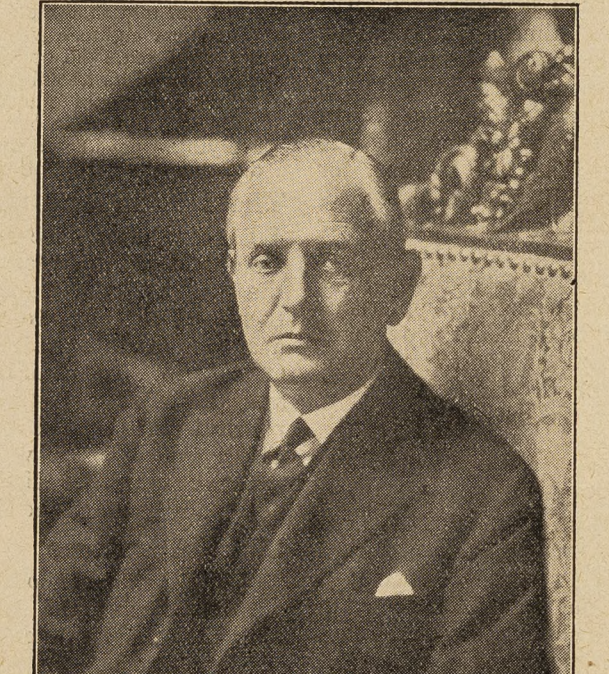
M. Herluf Zahle (President of the Assembly)

The work of the League is increasing every year, and it becomes correspondingly less easy to follow the details of it as they are dealt with in a League Assembly. But so far as the field of vision can be comprehended at a glance the impression created is one of health and vigour. The Ninth Assembly was, on the whole, a little better than the Eighth, and not quite as good, it may be hoped, as the Tenth will be.