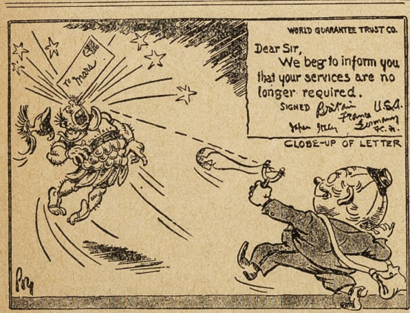
LETTERS BY CATAPULT

"Children, you represent the League of Nations. The British Empire is a leader in the League of Nations, which exists to prevent another war. The Empire is loyal to the League of Nations, and we must be loyal to the Empire." Constant agitation is being made to persuade the Australian Government to sign the "Optional Clause."