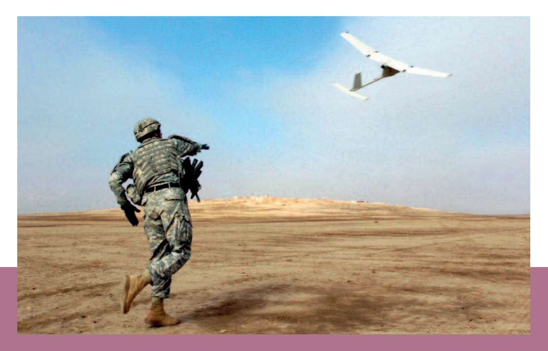
US soldier launching a Raven remote-controlled unmanned aerial vehicle © public domain.

In 2015, Remote Control commissioned eleven in-depth reports from experts in the use of Special Operations Forces, private military and security companies, cyber warfare, mass surveillance, counter-terrorism, international human rights, and drone and air strikes. We also produced a Remote Control Warfare series for the sustainable security blog, and cemented our relationship with a number of universities around the country with a series of panel discussions and workshops. We will be continuing this work in 2016 under new leadership, and with greater in-house advocacy and research capacity.