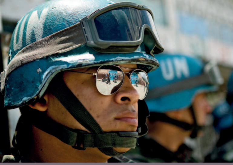
UN peacekeeper

Preventive diplomacy is a form of early intervention aimed at preventing conflict from becoming violent or escalating. ORG has pioneered alternative forms of diplomacy independent from the political interests, bureaucracy and policy positions that encumber national and international diplomats. We call this the Oxford Process.