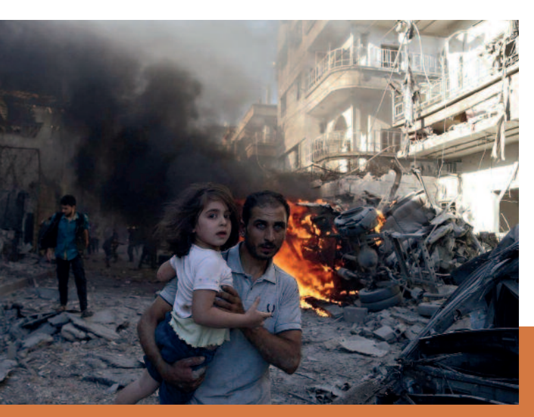
Man with child amidst the devastation in Syria

In the face of rising sectarian violence in 2015-16, the Group was particularly focused on expanding the 'cross-green line' space for dialogue between Palestinians residing in the occupied territories and Israel. The impact of the PSG's work was clearly seen in the PLO's new strategic plan (2015) and in the creation of a new Advisor for Strategic Affairs post in the Palestinian President's office.