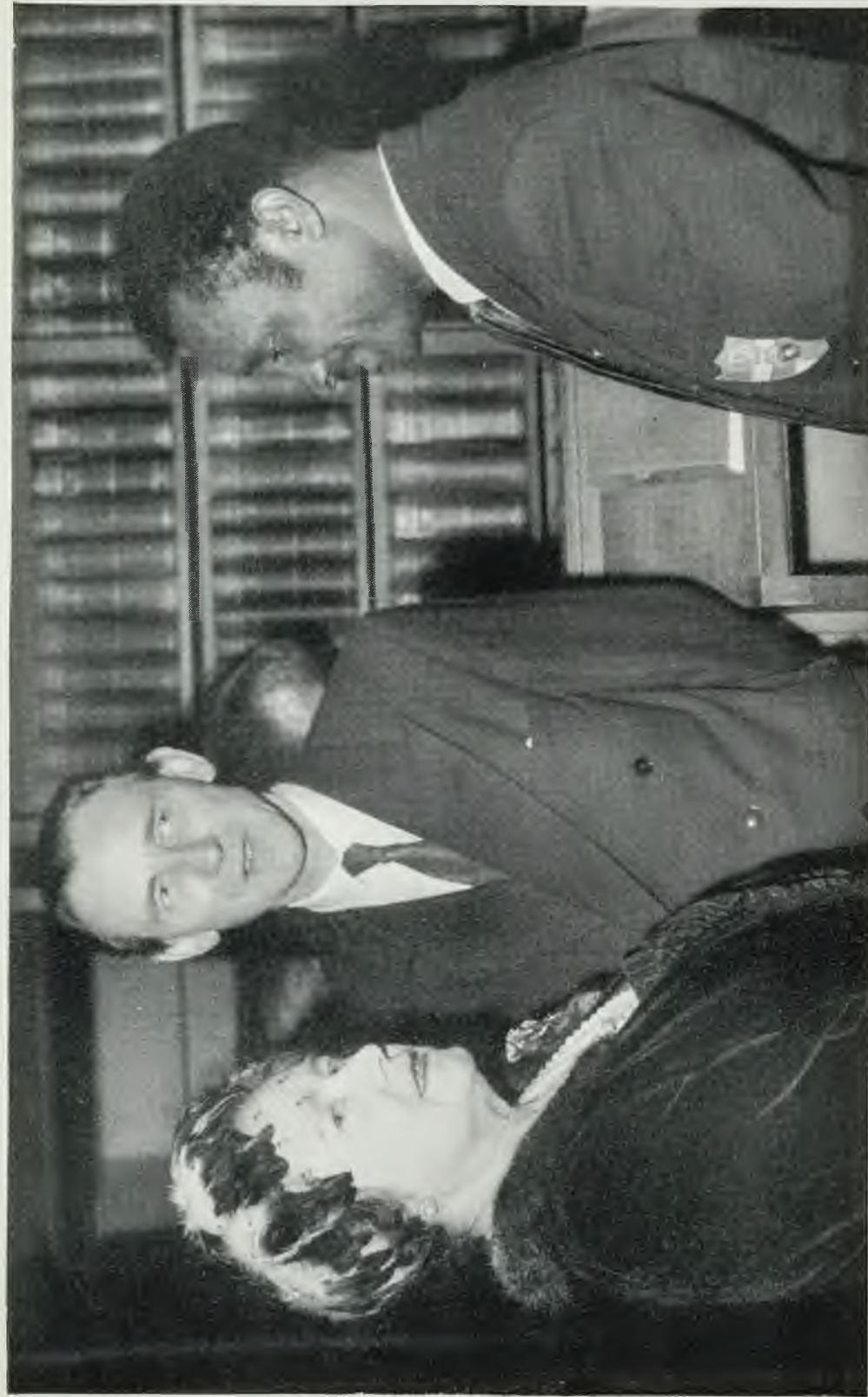
VISIT OF THE CHANCELLOR TO THE SCHOOL 23 February 1960

Queen Elizabeth The Queen Mother, Chancellor of the University of London, in the Library with the Director and a student.