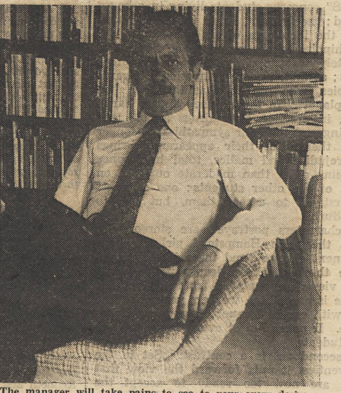
The manager will take pains to see to your every desire and make your stay as comfortable as possible.

Full sports facilities : a gymnasium, football, rowing, swimming, mountaineering and frequent marches.