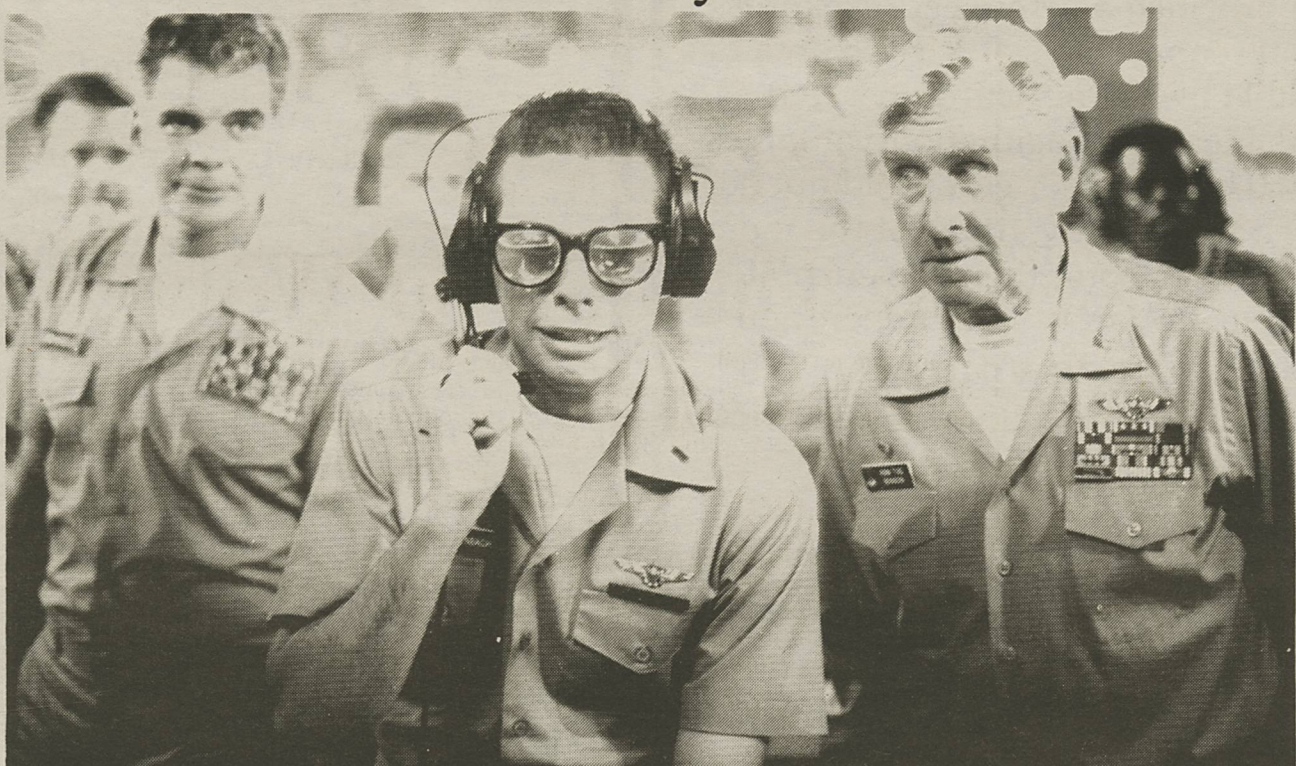
The Rollercoaster afflicted many people in many ways.

With such hype sur-rounding the event there was every possibility that the actual concerts would be something of an anticlimax rather than the multiple orgasms that the press would have you believe. In fact the concert was neither a hit nor a