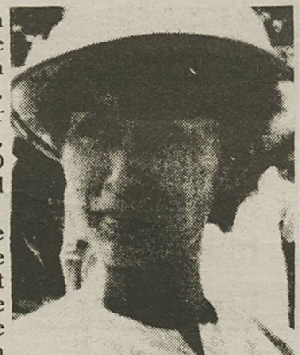
Aung San Suu Kyi

Suu Kyi is free to leave the country only on the condition that she does not come back. However, she intends to stay until all the other prisoners have been