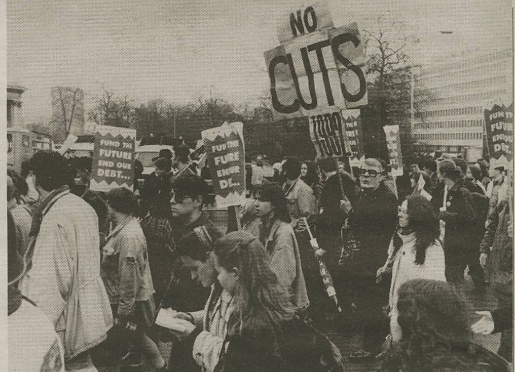
Scenes from Wednesday's demonstration

Amongst London colleges, one of the largest rep-