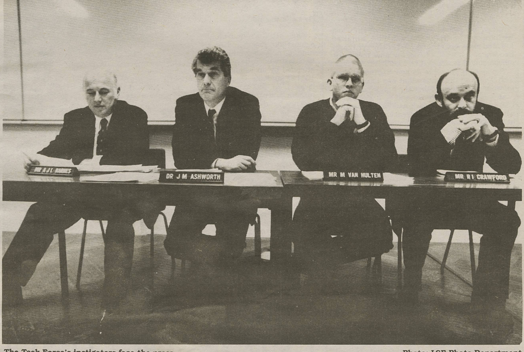
The Task Force's instigators face the press

The final completion of this substantial report will be published in full shortly. In its findings, the Group is unanimous that there are "real and urgent problems resulting from the ruthless financial pressure by the Government on higher education". It is claimed that students can no longer manage their finances without extensive borrowing, paid employment or parental funds.It is the increase of student debts, during this time of recession, that has given cause for concern at the School. Although the investigation involved both home-students and overseas students, it was recognised that home-students are "more vulnerable" since they are funded by the government and hence are facing more hardship than other students. The main concern of the findings was that second year undergraduates appear to be in the worst position, shown by the overall highest level of loans or borrowings. This implies worsening conditions to the