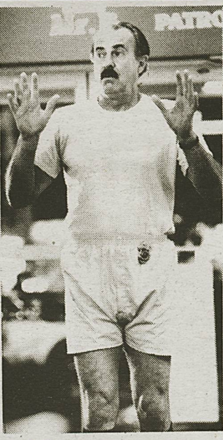
Burt Simpson (Dabney Coleman) decides to tackle an explosive situation without weapons-or clothes!