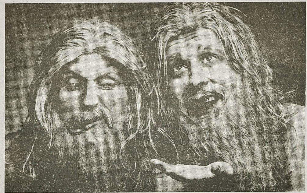
"Noonday Demons"-two minds are better than one

A whacky tale of two over- zealous monks