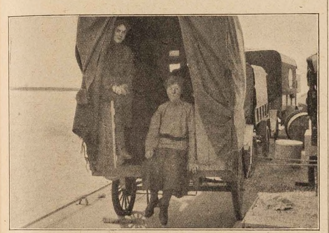
Ambulances driving on to a Barge.

The Column consisted of five ambulances, one lorry, one otor-kitchen, and one run-about car. It was attached directly