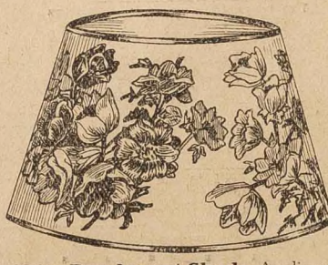
18 in. Parchment Shade, Applique of cretonne. 15 ins. 11/9

Finely Illustrated Catalogue "Seasonable Necessities" obtainable on request