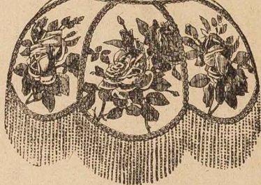
Dome Paper Shade, Cretonne Applique, lined Muslin, veiled Ninon and trimmed bead fringe, floor 21 in. diameter. Price 29/6

These lamp shades are just a small selection from a beautiful and varied stock always on view. Being designed in our own Studios and made in our own Workshops, they possess an exclusive character which appeals strongly to those who desire to express individuality in their surroundings. designs can be supplied to harmonise with any suggested colour scheme in house furnishing