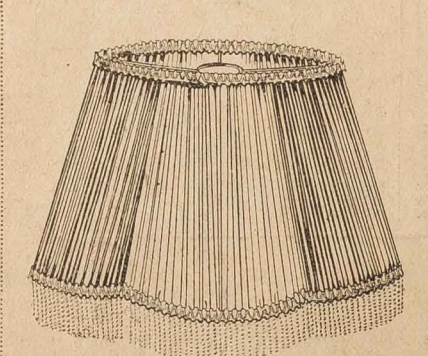
20 in. Florentine trimmed bead fringe and gimp. Price 10/9