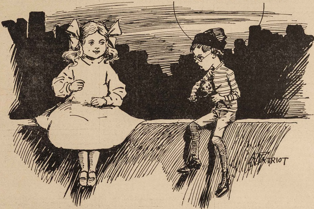
[With acknowledgments to Nestlé Milk]

LITTLE GIRL: "Why are you so thin?" LITTLE BOY: "My father is a Government employee, so my mother was refused maternity benefit when I was born."