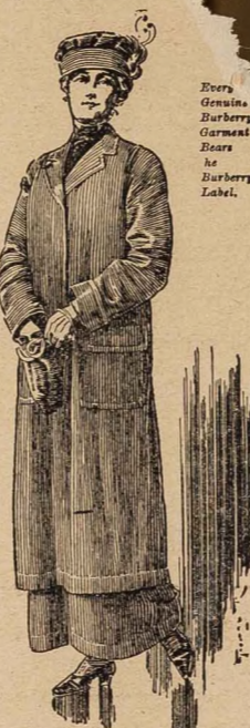
The Robustor Urbitor. Write for the book of THE URBITOR. It is well worth while.

There are many designs of THE URBITOR coat itself—models for every purpose.