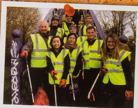
Tidying up Coldham's Common with Anglia Ruskin Students