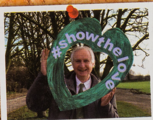
Backing #Showthelove campaign to tackle climate change