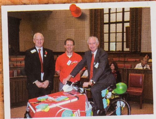
Working with our Labour Council for a fairer city