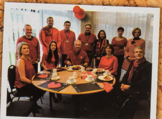
A hearty breakfast at Cambridge Regional College to raise cash for British Heart Foundation research