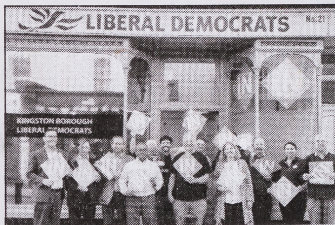
Local Kingston Liberal Democrats campaigning for Britain to remain IN EUROPE #INtogether

The EU referendum is a once in a generation opportunity to vote for what you believe in. Liberal Democrats are the only party united in campaigning for Britain to remain IN the European Union .